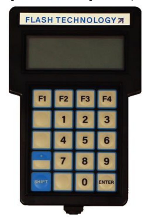
Figure 1.1 Handheld Programmer Layout

The Handheld Programmer is supplied with a permanently attached RS232 cable with 9 pin female connector. Plug the Handheld's cable connector into the 9044 PCB connector J2 (9 pin Male connector).