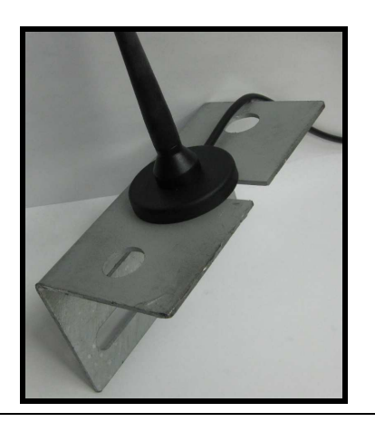
Magnetic Mount Antenna